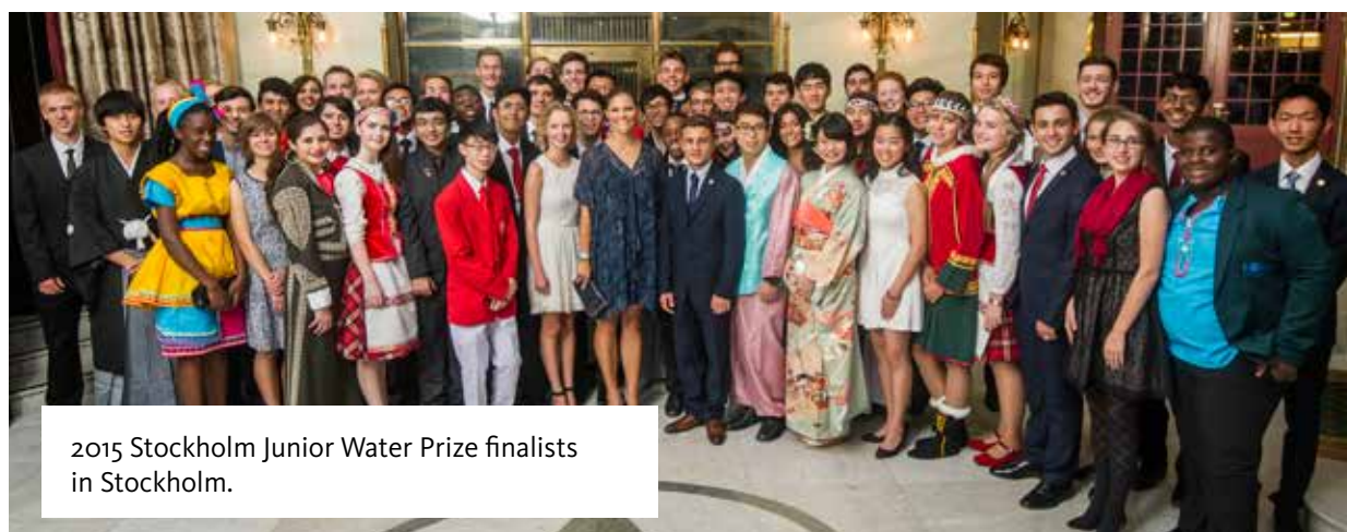
2015 Stockholm Junior Water Prize finalists in Stockholm.