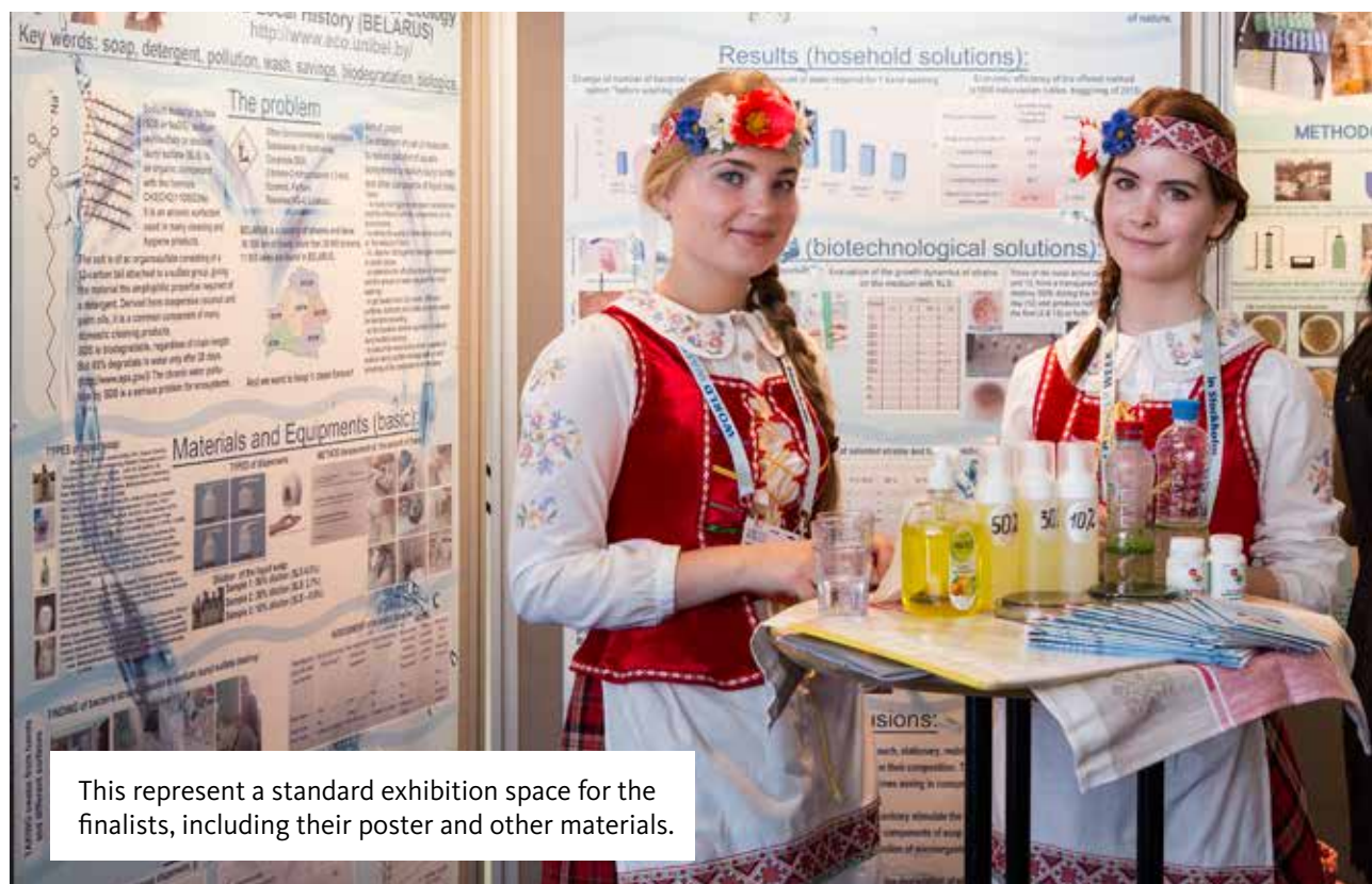
This represents a standard exhibition space for the finalists, including their poster and other materials.

Presenting the project at the International final | The competition entry for the International Final must be presented in two parts: a written project with a report and a project display for public exhibition. Everything must be presented in English.